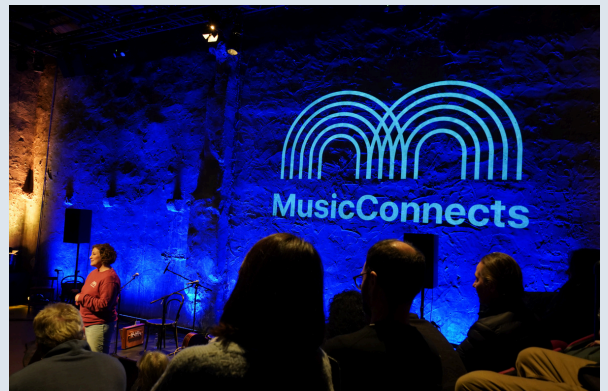
3 Kinds of Music - November