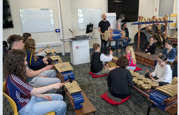
Our Ensemble Skills Participants working with In Flow Gamelan Ensemble