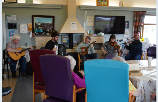
Galvian Way at Teach Altranais Charna, Carna

Music in the Afternoon continues to be one of the most moving and impactful programmes that we deliver, both for the residents, their families and care home staff, and also for our musicians and staff, who see first hand the power of music and connection.