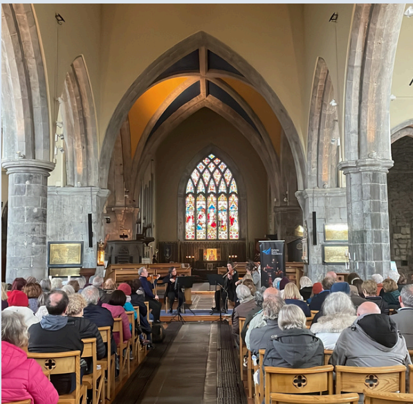
Lunchtime with ConTempo - March - Music of Woodland Wonder

Our flagship series, Lunchtime with ConTempo, continued on the first Tuesday of each month (February-May and September to December) at St Nicholas' Collegiate Church. Our 2025 theme of Nature & Ecology gifted us with wonderful repertoire that captivated audiences, sometimes bringing them to new music worlds. Performed by ConTempo Quartet, this music celebrated the natural world, exploring flora and fauna, delicately balanced ecosystems, the migratory patterns of animals, the impact of light and weather, and more. We were delighted to be able to bring awareness to the biodiversity crisis through music, taking pause to consider how we can all support the environment around us.