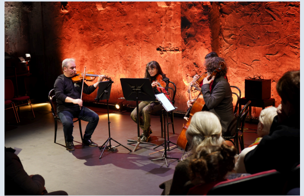
3 Kinds of Music - ConTempo Quartet