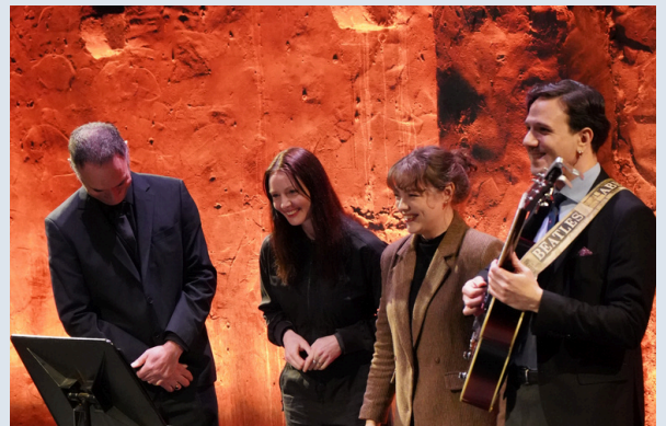
3 Kinds of Music - Java Blue