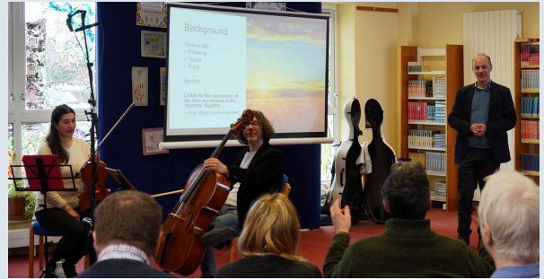
Music Unveiled at Ballybane Library

These informal and accessible sessions deconstructed some of the music performed each month. Each Music Unveiled was recorded and made available online for those who were unable to attend the event live.