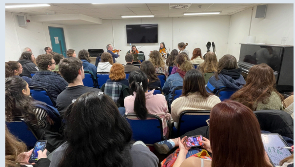
BA Creative Writing workshop

We also worked closely with the BA and MA in Writing. ConTempo Quartet and visiting speakers worked with students to discover the interplay between music and writing, and the broader creative process. Some students created work in direct response to the music performed by ConTempo Quartet, while others examined their personal writing process.