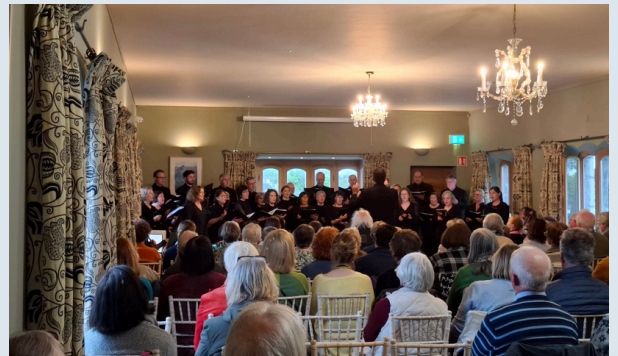
ConTempo Countywide - Claregalway

MusicConnects continued to serve communities the length and breadth of Galway through our ConTempo Countywide series. We brought our Nature & Ecology programmes to local centres across County Galway, presenting ConTempo Quartet to audiences in Connemara National Park, Oughterard, Claregalway, Loughrea, Portumna, Headford, Kinvara, and An Spidéal.