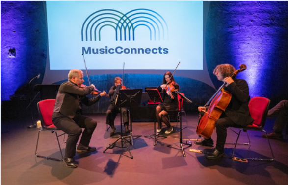
Rebrand Launch - ConTempo Quartet