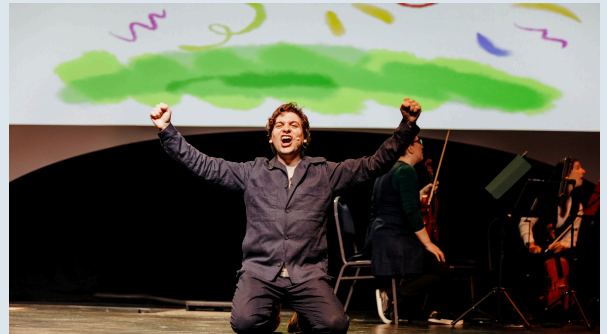
Story of a Day - Scéal Lae